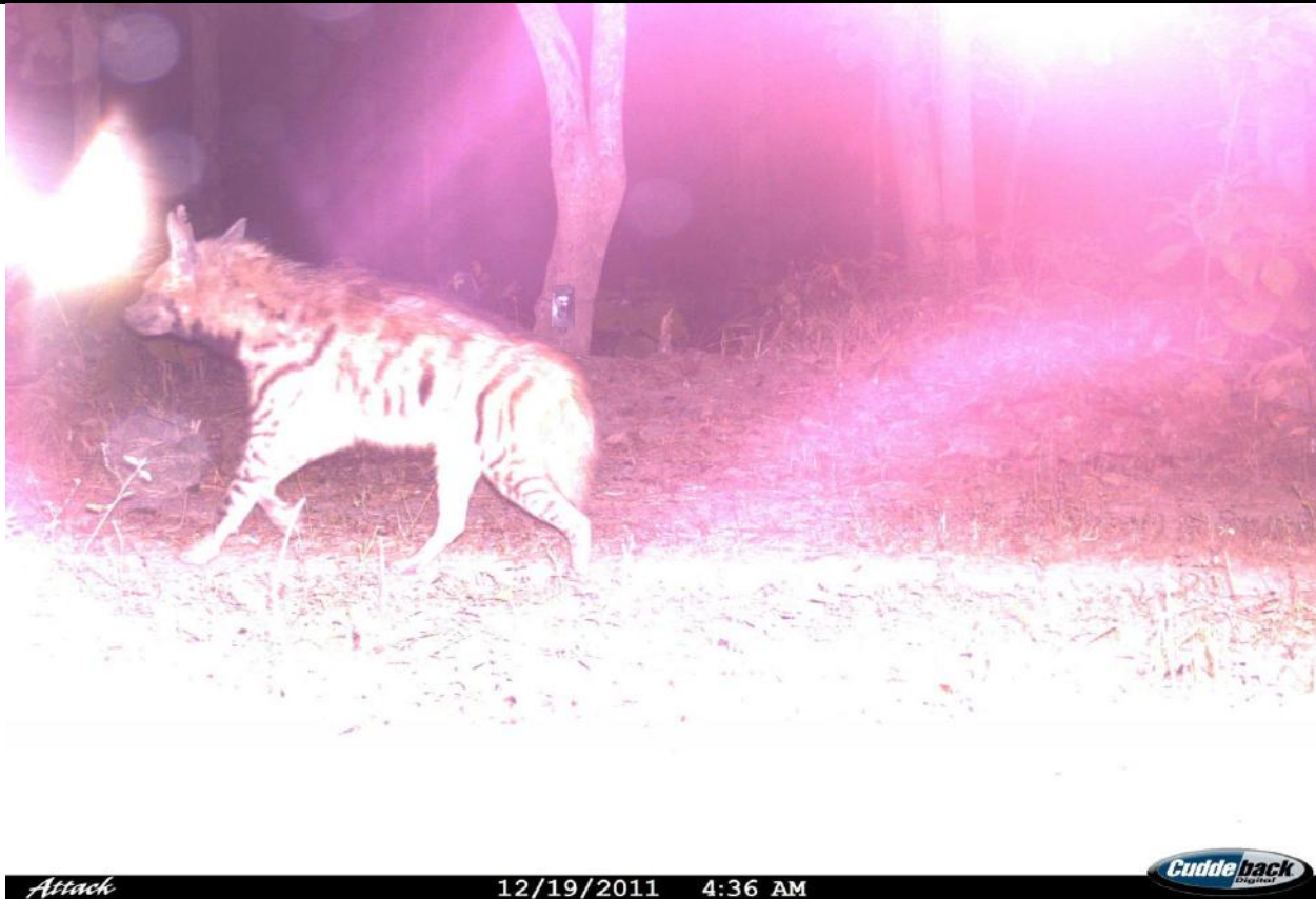
Fig.3: Striped Hyaena photo in Camera Trap at 4:36 AM