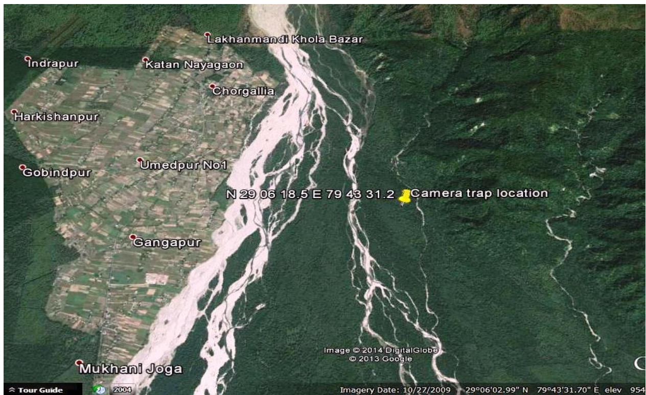
Fig.4: Camera traps location of Striped Hyaena in the study area.