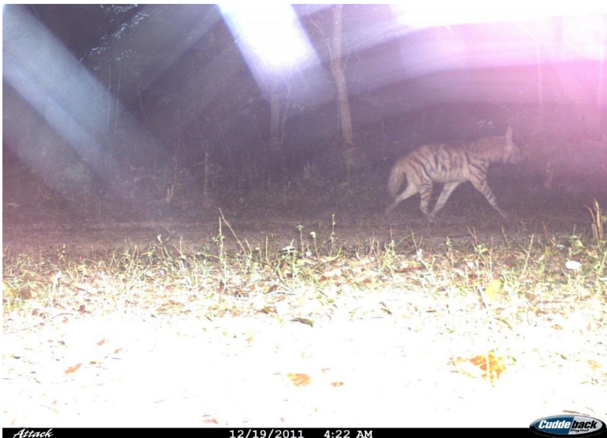
Fig.2: Striped Hyaena photo in Camera Trap at 4:22 AM