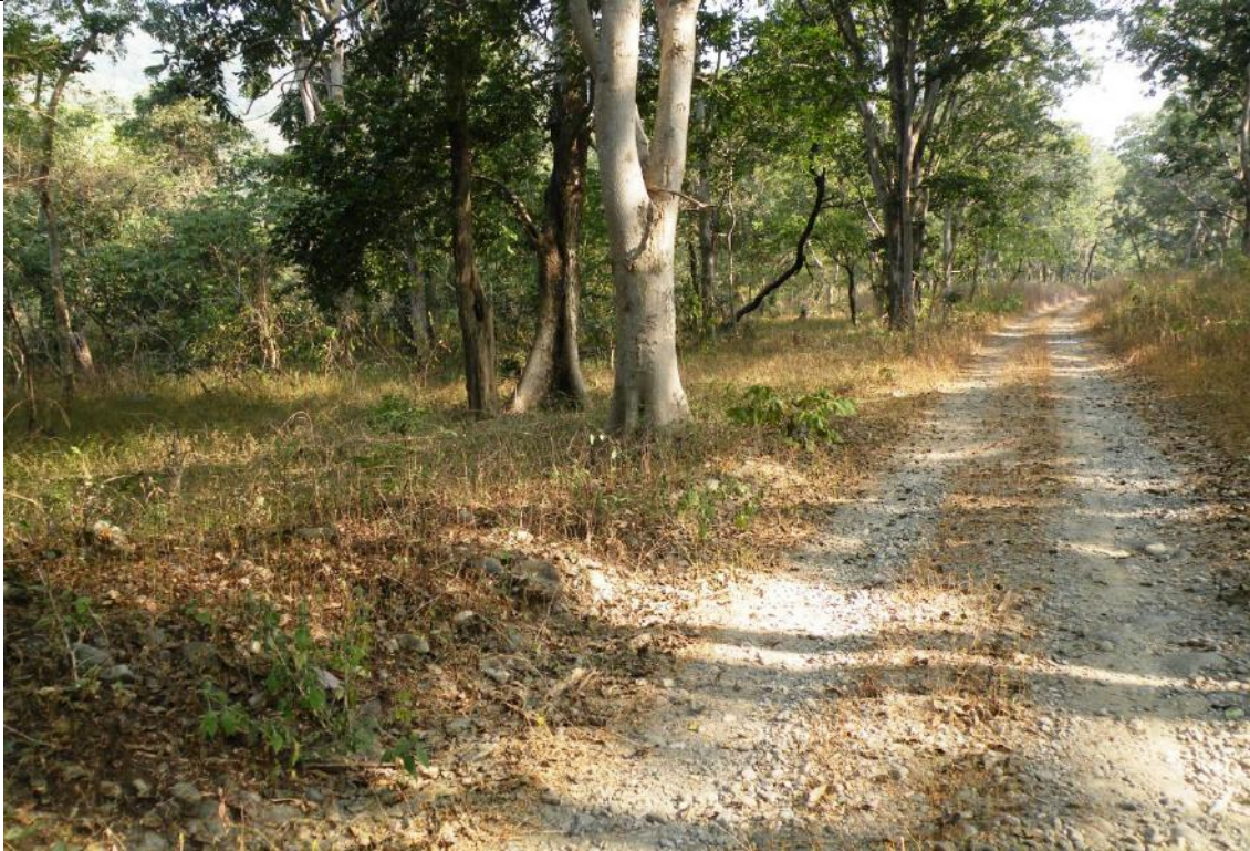
Fig.5: Striped Hyaena habitat in the study area.